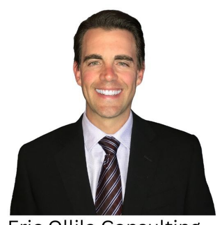
Eric Ollila Consulting

www.burmanu.ca/speakerseries busreception@burmanu.ca 403-782-3381 X 4095