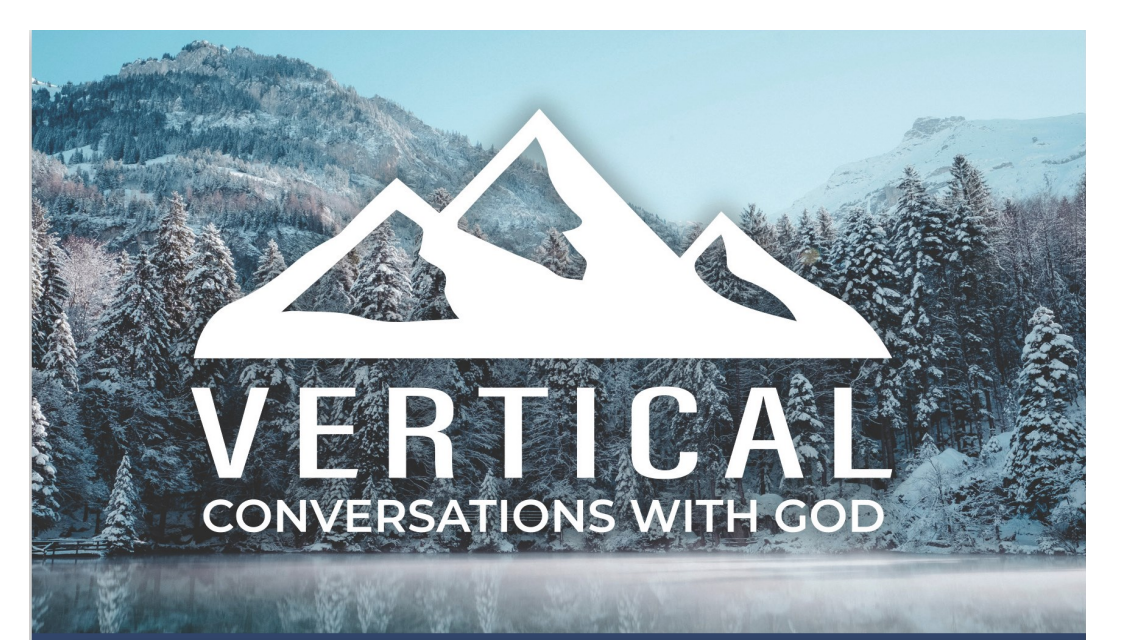
Presented by the College Heights Church Prayer Ministry Team

God not only wants to hear from you, He wants to talk to you, too. Come learn how to enjoy Holy Spirit-led conversations with God through prayer and the reading of His Word.